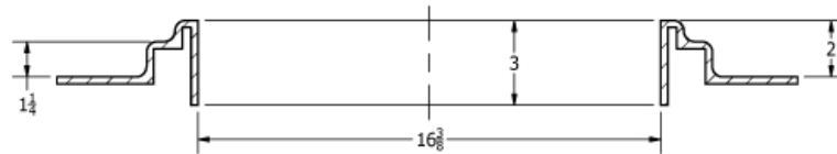
SECTION A-A SCALE 1:4